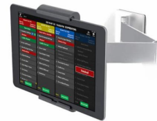
Aldelo Express Kitchen Display System (KDS)